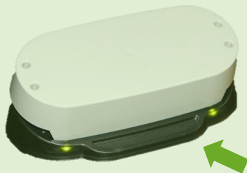
External battery charger