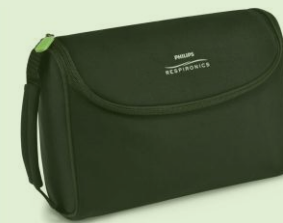
Accessory Bag (Black or Brown)