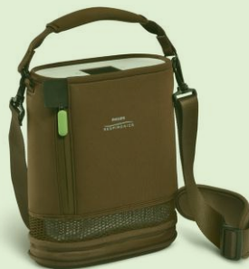
Carry case (Black or Brown)