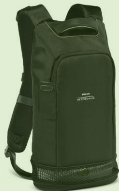
Backpack (Black or Brown)